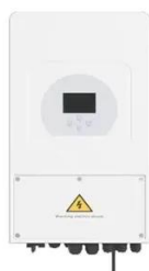
Figure the average kW usage for a year and put the answer in the top box. Next use 100% in the "percent of bill to cover" field to get an idea of the proper size of the system.